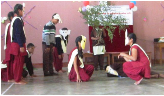
A panchatantra tale emerges as skit at Wakro