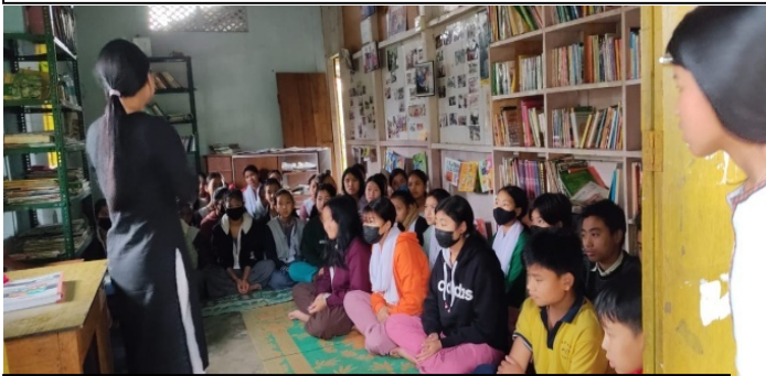
Tips to junior readers at APNE Library, Wakro!