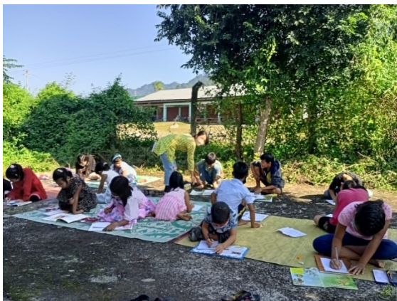
National Book week contests@ APNE Library, Wakro