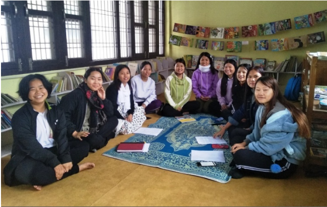
Senior Volunteers at Bamboosa Library, Tezu