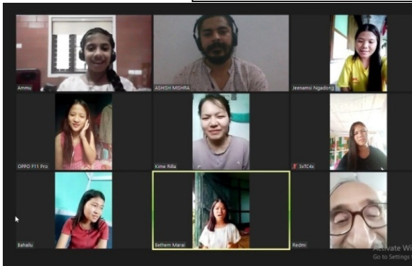
Google Meet for all library planning!