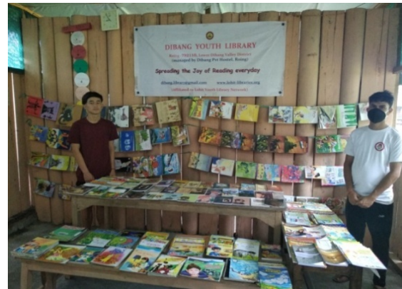
(R) M/s Pai International Electronics, Bangalore's handsome contribution of books, furniture and carpets for 4 libraries have made them, attractive, enriched and comfortable too!