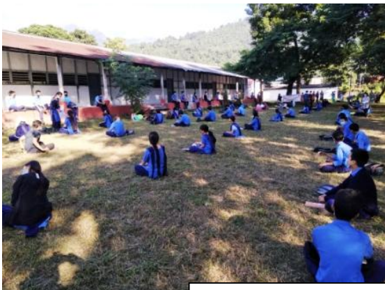
A Perfect SOP during Corona Pandemic! Book contests by Dibang Youth Library, Roing Nov 2021