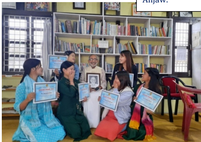
Reading Campaigns bind us together as dear ones, Where age matters little!