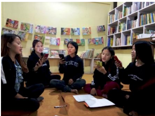
Getting to read poet Sugathakumari.... youTube link