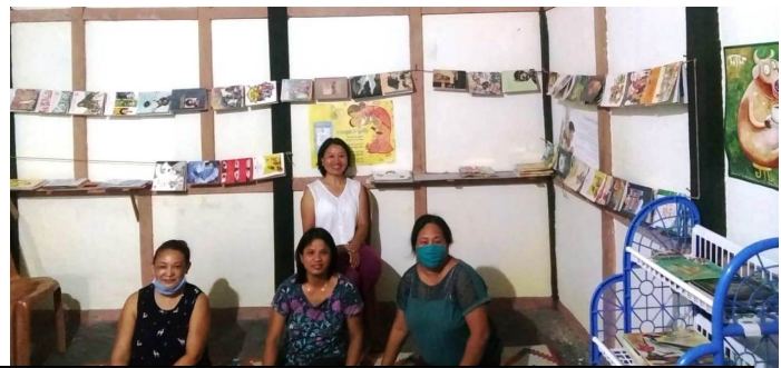
Namsai town gets a new Library! Mentors busy setting up book Displays.