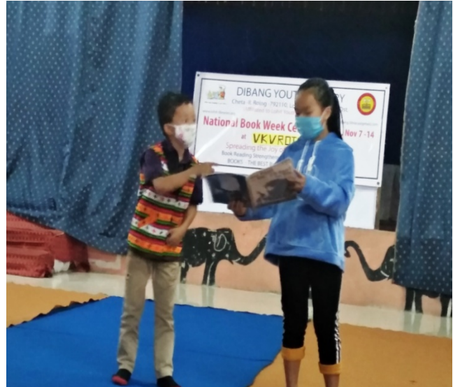
An enchanting Reading Theatre by activists of Dibang Youth Library, Roing