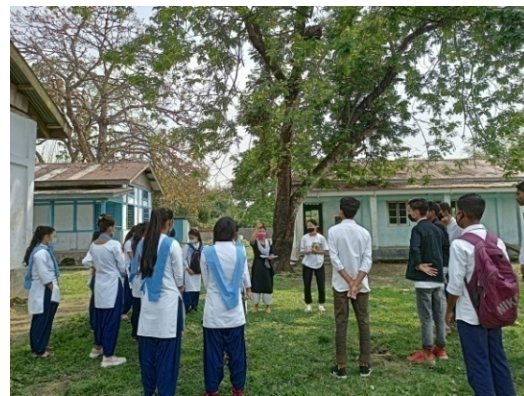
Medo Reading Promotion Workshop Apr 22-24, 2021 press clip