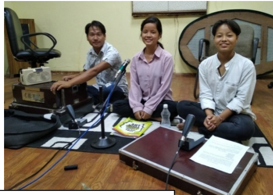
All India Radio Youth Programmes@ AIR Tezu