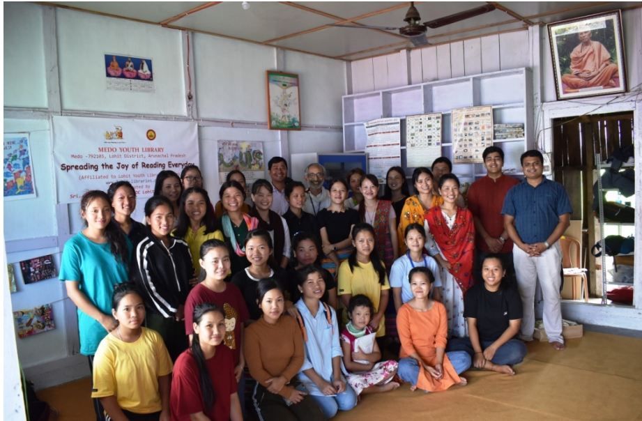
United we work and spread the fragrance of books and Reading all around! Library activists and mentors after the Medo Youth Library inauguration Jun 28, 2020