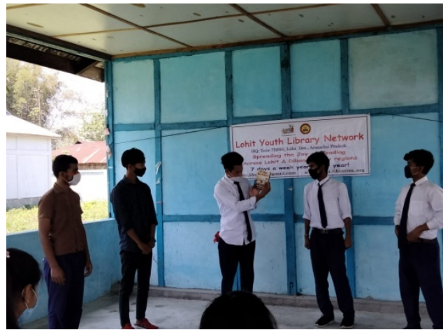
Student Participants at Medo Reading Workshop Apr 22-24, 2021