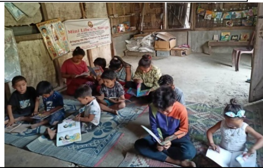
Even a Mini Library serves readers! Namgo Mini Library functioning since 2014