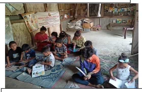
Even a Mini Library serves readers! Namgo Mini Library functioning since 2014