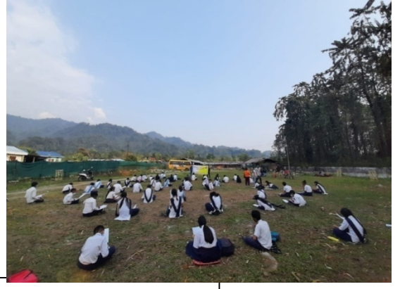
A Perfect SOP during Corona Pandemic! Book contests by Dibang Youth Library, Roing Nov 2021