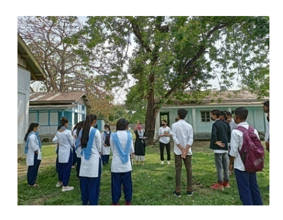
Medo Reading Promotion Workshop Apr 22-24, 2021 press clip