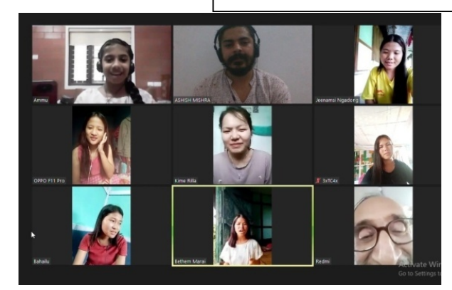
Google Meet for all library planning!