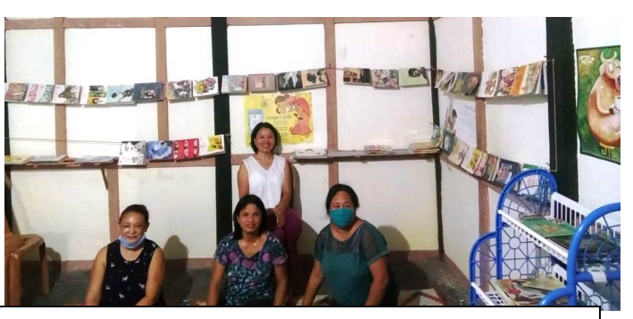
Namsai town gets a new Library! Mentors busy setting up book Displays.